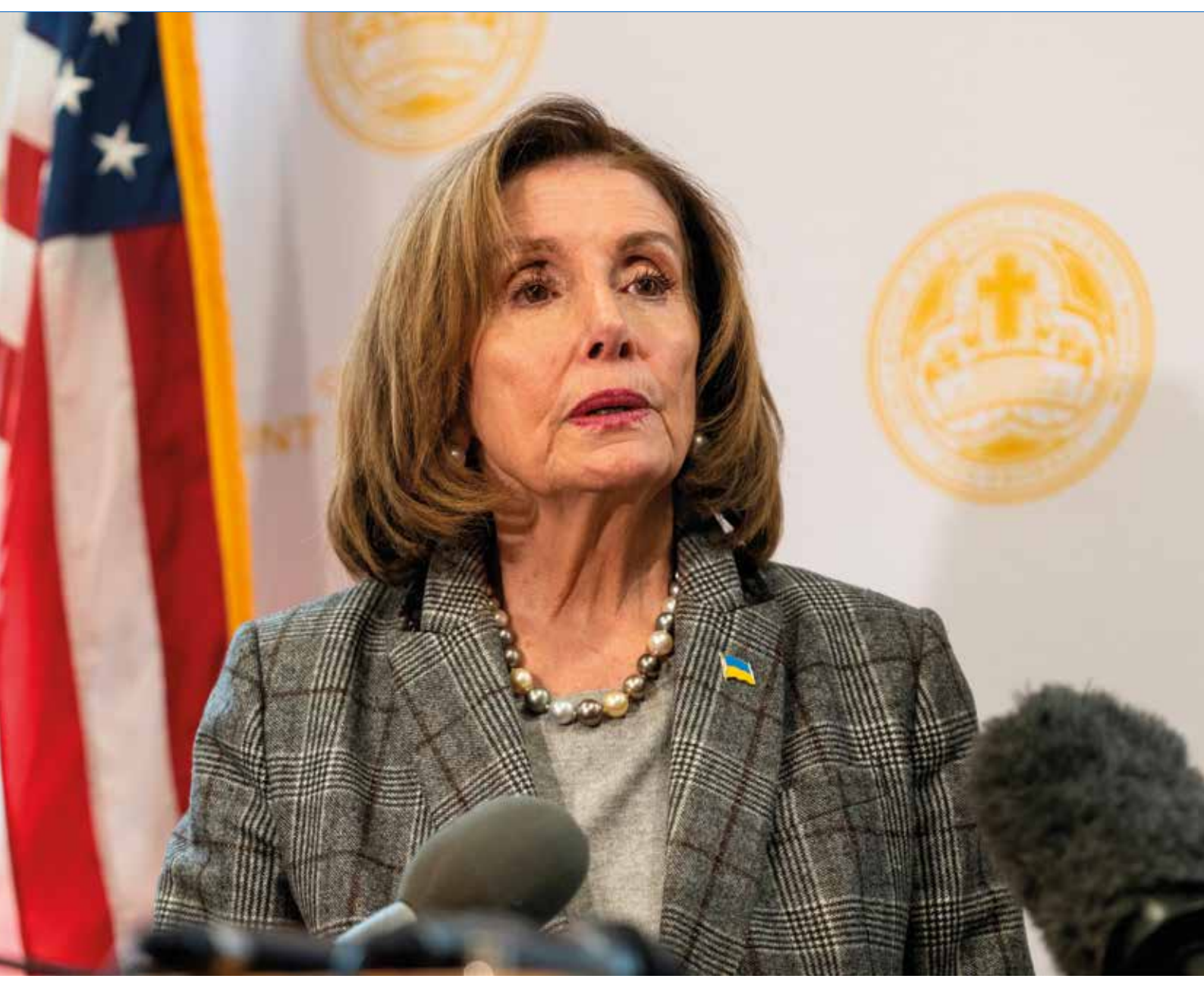
It is possible that Democrats will lose only a few seats, but will win a majority on November 8th, thereby allowing Speaker of the House Nancy Pelosi to keep her fingers firmly clenched on the levers of power. Pictured is Pelosi holding a town hall at Mount Saint Vincent College, New York in March 2022

ocratic District Attorneys, law enforcement is standing down in many locations, as it loses personnel to early retirements and resignations. No sane American would opt to become a police officer in today's anti-law-enforcement environment. Black Americans are increasingly looking to Republican ideas to end the Left's soft-on-crime approach.