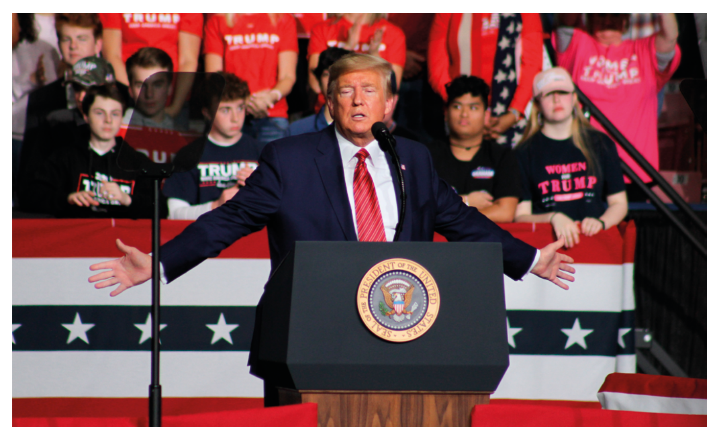
Should Trump shock the world and win reelection, it is possible he will bring the U.S. House and U.S. Senate with him. That result would ensure four more years of the kinds of policies Trump pushed in his first term. Pictured is Trump during a rally in the North Charleston Coliseum in February of this year

The big actions for Biden will be in resetting foreign policy to the liking of the Davos crowd. That means power restored to supranational organizations like the United Nations, the World Health Organization, and other globalist entities. While I'd expect Biden to pull back a bit on Trump's NATO financial rebalancing efforts, his change might be one of tone rather than content. U.S. taxpayers really are tired of paying the freight for Europe, so Biden will have to demand NATO members pay their fair share of its costs.