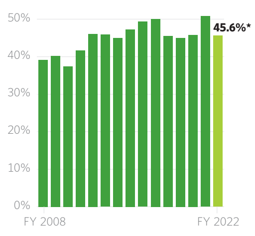
* Through Feb. 2022—8 months of FY 2022. SOURCES: Ohio Department of Medicaid and Ohio Office of Budget and Management.